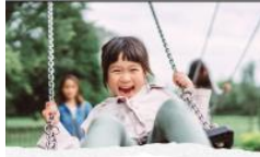
Active Supervision in Family Child Care