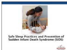
Safe Sleep Practices and Prevention of Sudden Infant Death Syndrome (SIDS)