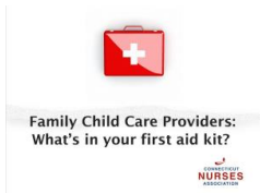
Family Child Care Providers: What's in your first aid kit?